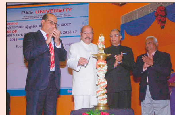
Inspiring Start for the New Batch of Students