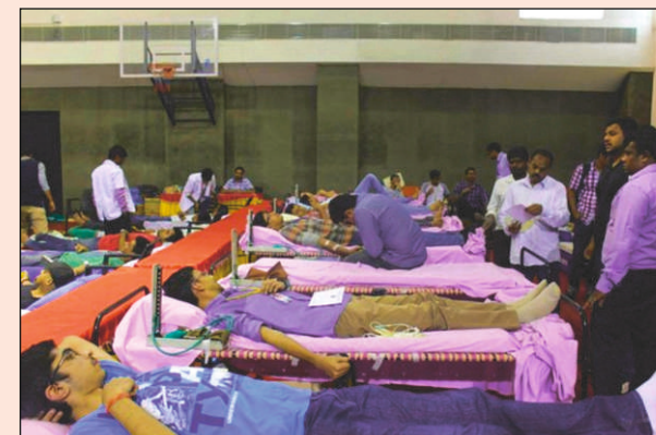
Students donate 853 life saving units of blood