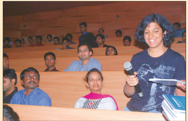
29th Bi-annual alumni meet