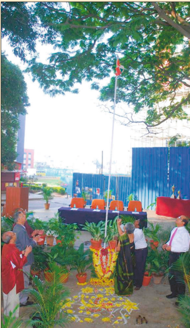
67th Republic Day Celebration