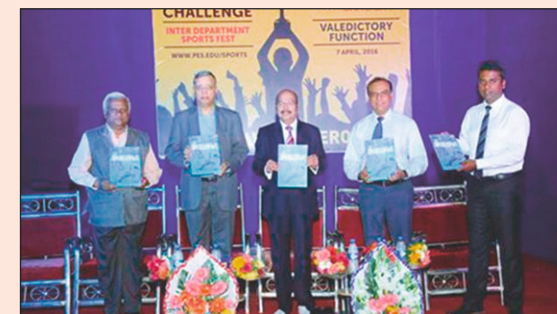
SPARDHA - PES Sports Magazine launched at THE SPORTS AWARDS 2016