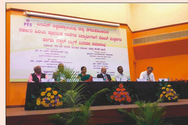
Reaching out to children in government schools