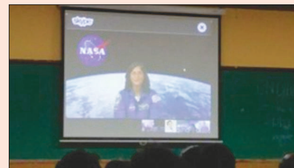
"Sky is the limit" - Astronaut Sunita Williams