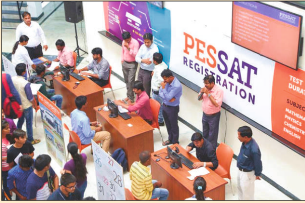
PESSAT 2016 opens up a world of opportunities